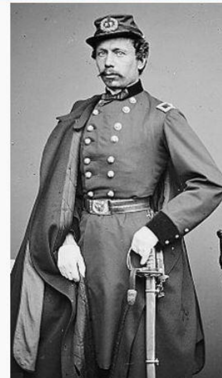
Julius H. Stahel-Számwald

Note: Major General Julius Stahel, US Army Congressional Medal of Honor awardee Consul to Japan Consul General to China Assistant Sec of State